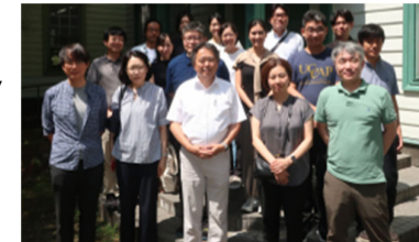
Fig.2 At the Workshop 2023